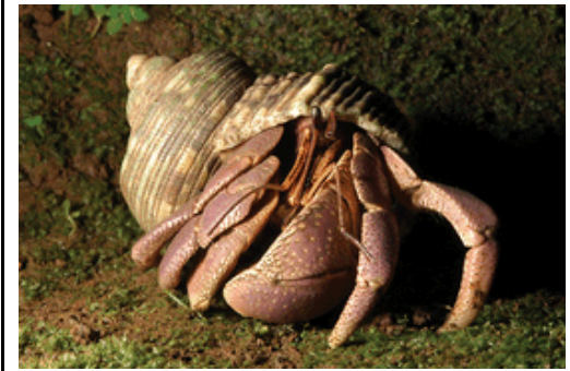
Picture Hermit crab

Crabs are animals with a hard shell and jointed legs. Some crabs live in shallow waters along seashores. Some are found in deeper waters. Only a few crabs live on land or in fresh water. Some kinds of crabs are good to eat.