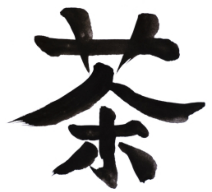
The Character Tea